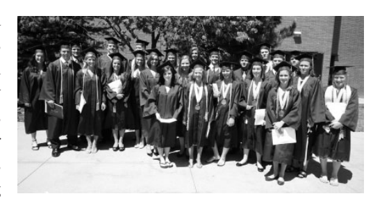
2009 Olmsted Falls Endowment & Alumni Association Scholarship Winners

Thanks to the generous support of local individuals, families, businesses and organizations who contributed to the Olmsted Falls Local Scholarship program this year, 223 scholarships totaling more than $118,500 were awarded to students from the Olmsted Falls High School Class of 2009. Olmsted Falls School District greatly appreciates the support of each and every one of our local donors, and acknowledges the important role their contributions play in paving a path of continued success for our students. Congratulations to this year's winners who were awarded their scholarships at the Honors Day Ceremony held May 29th. These young people are outstanding representatives of Olmsted Falls Schools, and the District wishes each of them well as they pursue their future endeavo